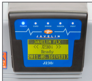
Easy to read LCD screen