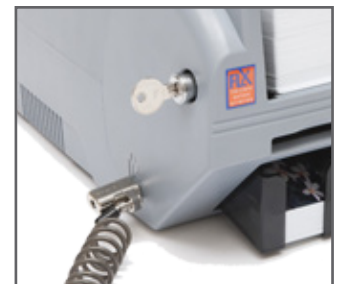
Optional locking input hopper & Kensington® ClickSafe™ cable