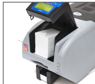
Input hopper & Output staker