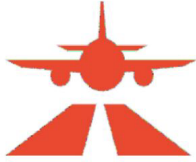
Airport Border Control