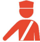
Security Access Control