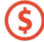
Finance Payment Process